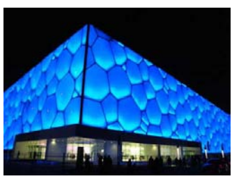
March. 27 8:30-17:30